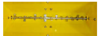
Uniform scatter, accurate spread width, adjustable agitator vanes