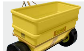
Hopper attachment 25 L (accessory)