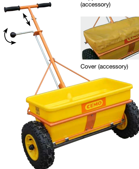
Adjustable – length handle, large operating lever