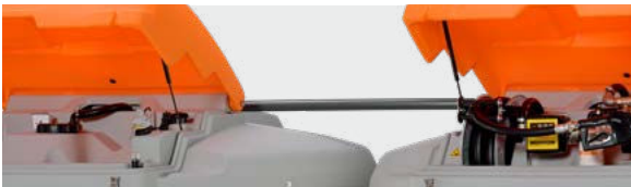
Suction hose with connection to first tank and switching valves included in the expansion unit.