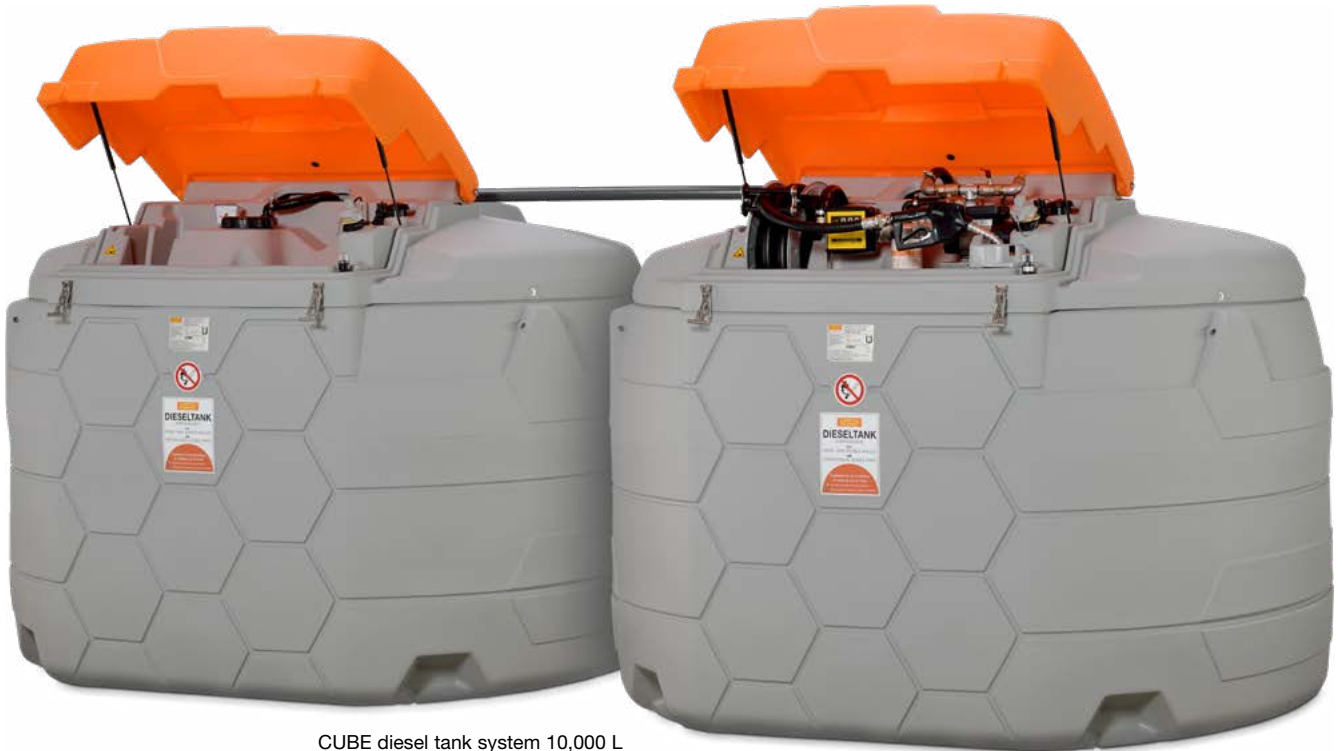
CUBE diesel tank system 10,000 L Outdoor Premium