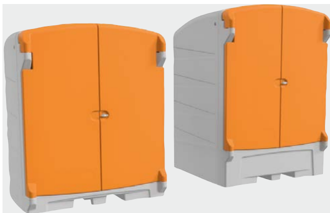
PE hazardous material depots 220/2 and 1100/1