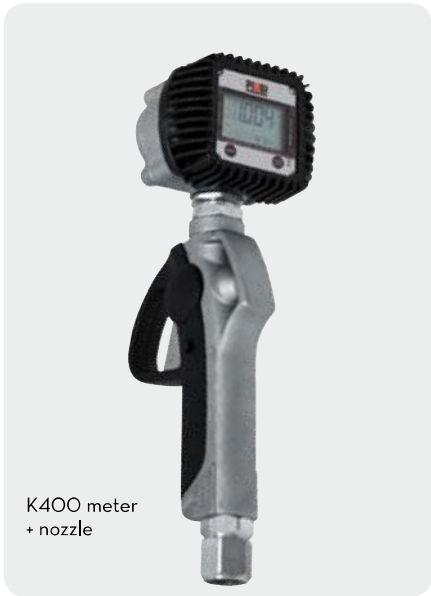
K400 meter + nozzle