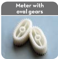
Meter with oval gears