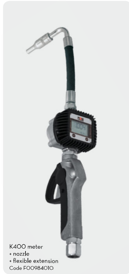
K400 meter + nozzle + flexible extension Code FO0984010