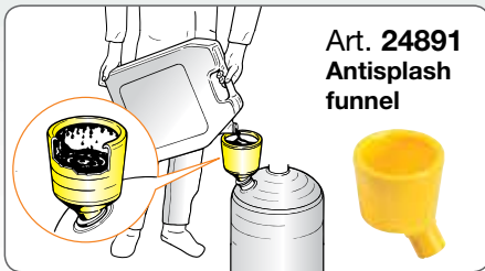
Art. 24891 Antisplash funnel

Devices for the non-toxic spraying of low viscosity detergent liquids, such as lubrication oils and similar. Suitable for washing motor vehicles, graphiting, lubricating, delivering dismantling oils, etc. Filled to 3/4 their capacity with the required liquid and pressurised with air at 6 - 8 bar, they work independently without requiring continuous connection to the compressed air line.