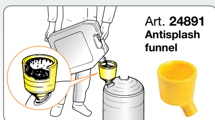
Art. 24891 Antisplash funnel

Devices for the non-toxic spraying of low viscosity detergent liquids, such as lubrication oils and similar. Suitable for washing motor vehicles, graphiting, lubricating, delivering dismantling oils, etc. Filled to 3/4 their capacity with the required liquid and pressurised with air at 6 - 8 bar, they work independently without requiring continuous connection to the compressed air line.