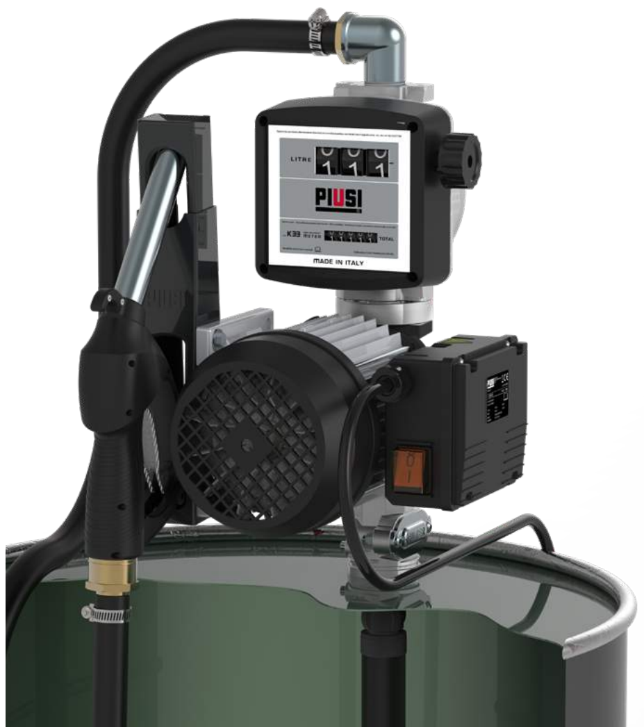
VISCOMAT VANE DRUM