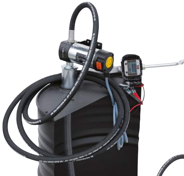
VISCOMAT GEAR DRUM DC