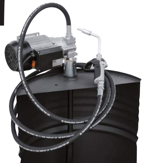
VISCOMAT GEAR DRUM AC