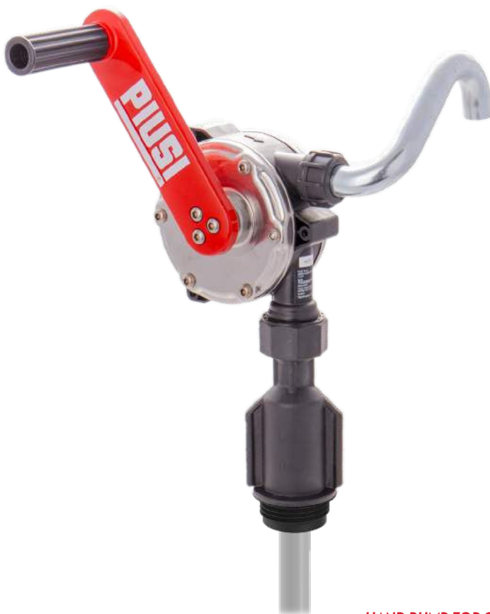
HAND PUMP FOR OIL-DIESEL