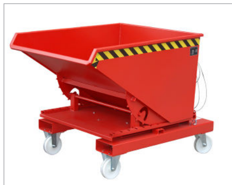
S3S with castors