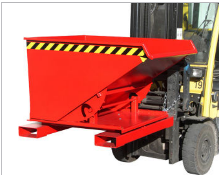
3S, ready to empty to the left