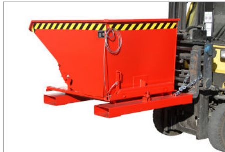
3S, ready to empty to the right