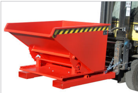
3S, ready to empty forwards