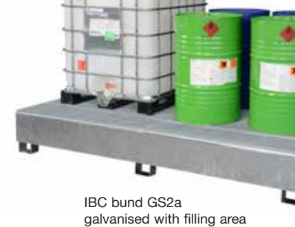
IBC bunds made of steel