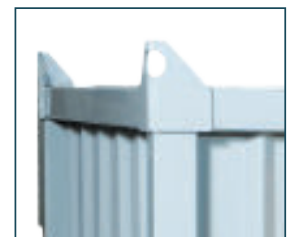
Triple stacking when empty for efficient storage