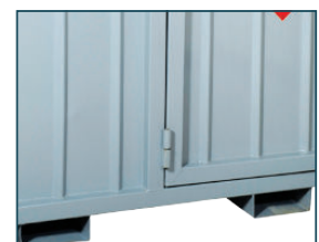
Safe and handy forklift pockets on each side