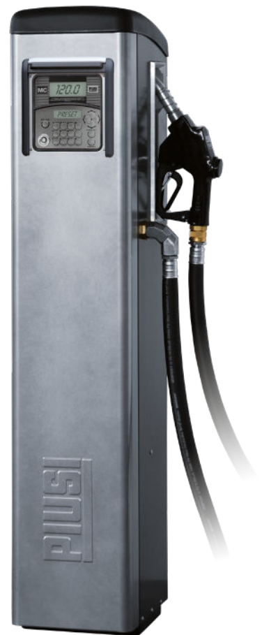
SELF SERVICE MC