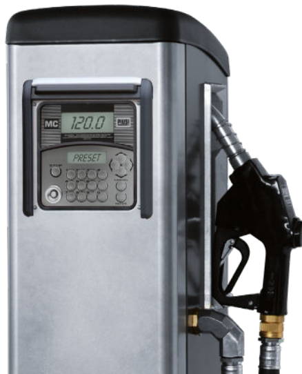
ELECTRONIC METER INTEGRATED