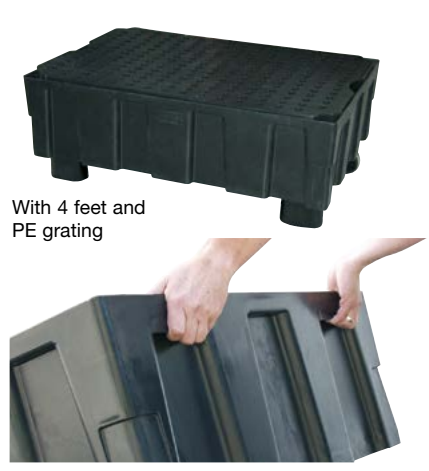
Integrated recessed handles for easy lifting