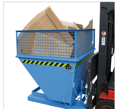
AK with mesh extender frame