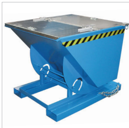
AK with lid