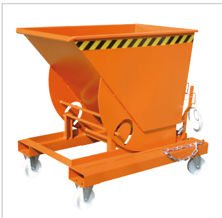
AK with castors