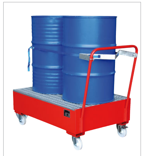
Tension Belt for 2x200 litre drums