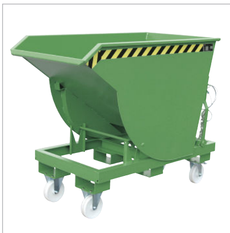
BKM with castors