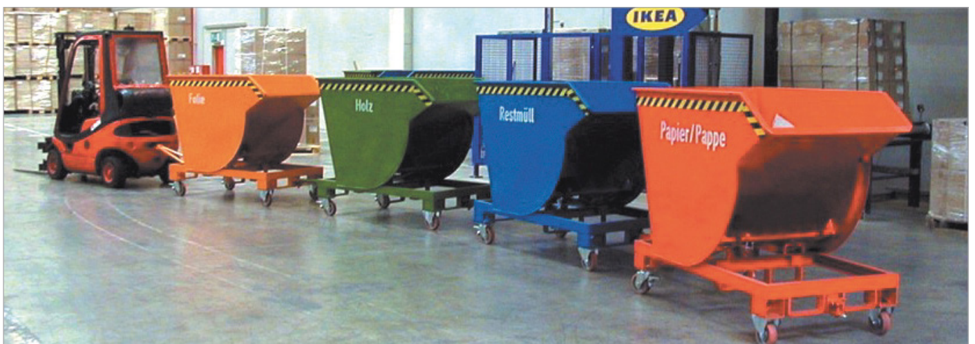
BKM with castors, trailer coupling and towing bar