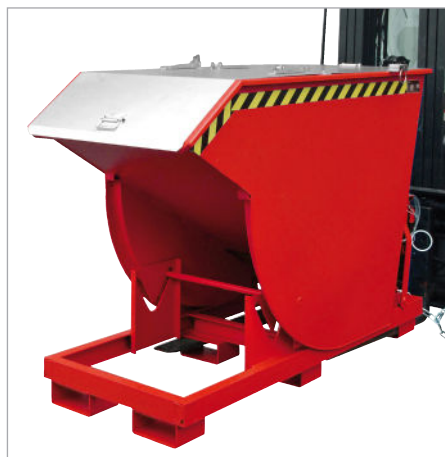
BKM with lid