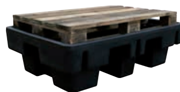
PE sump/spill pallet 230/2