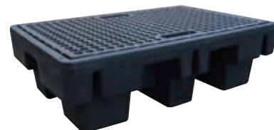
PE sump/spill pallet 230/2 with PE perforated plate (accessory)