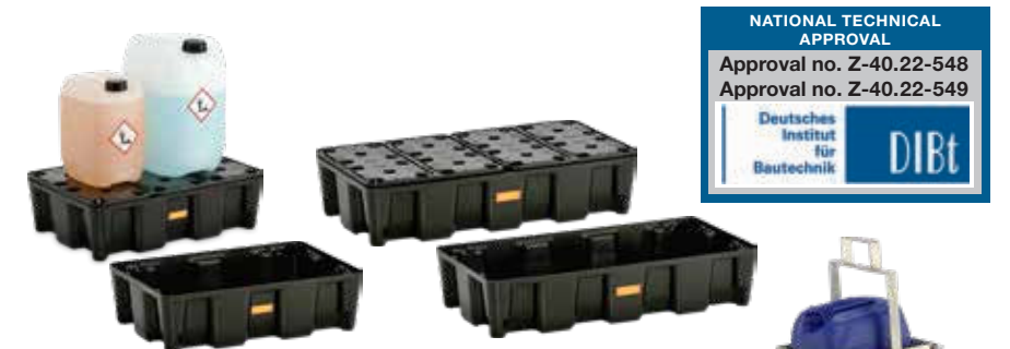
PE sump/spill pallet 25 HD with and without PE grating