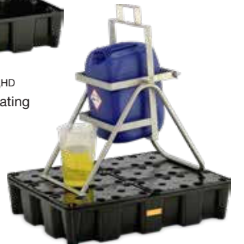
PE sump/spill pallet 60 HD with PE grating