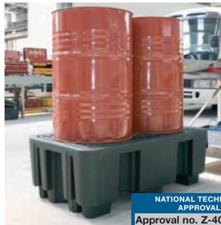
PE sump/spill pallet 240/2