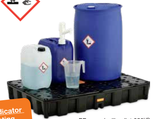
PE sump/spill pallet 250 HD with PE grating