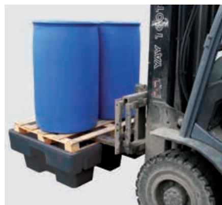
PE sump/spill pallet 230/2