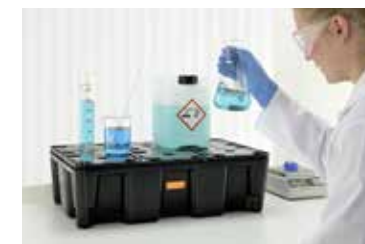
PE sump/spill pallet 25 HD with PE grating as laboratory tray