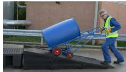
Accessory: access ramp for PE sump/spill pallet 240