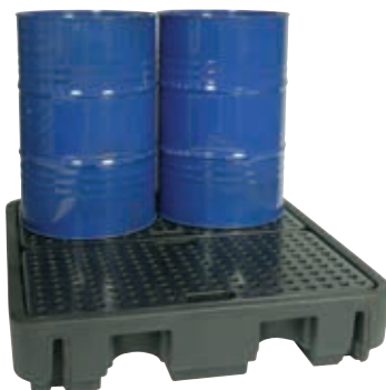
PE sump/spill pallet 240/4