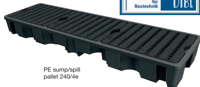
PE sump/spill pallet 240/4e