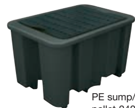
PE sump/spill pallet 240/1