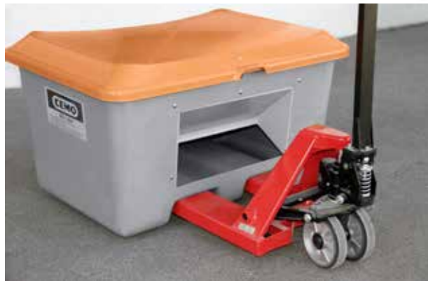
Can be forkliftable with lifting truck and forklift