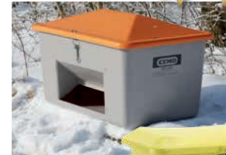
Colour combination grey/orange with chute