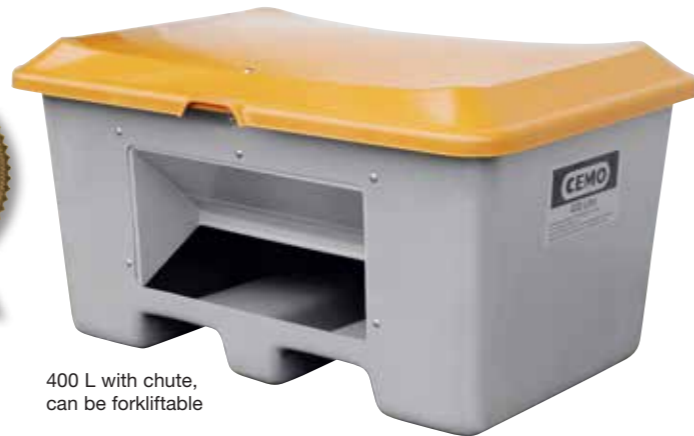
400 L with chute, can be forkliftable