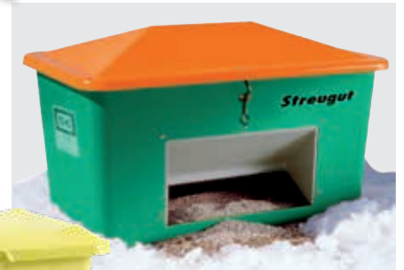
Colour combination green/orange with chute