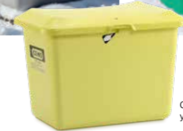
Colour combination yellow/yellow without chute