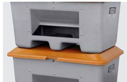
Can be stacked with closed lid