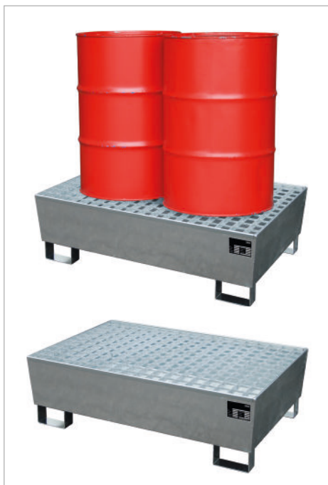
Type ECO-S 2/200