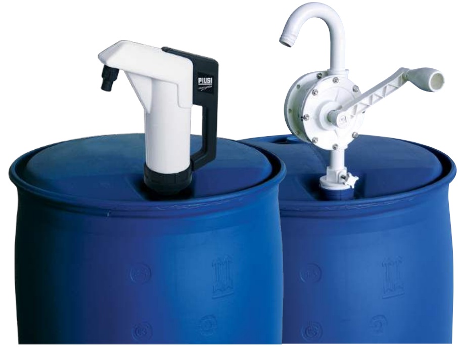
SUZZARABLUE HAND PUMP