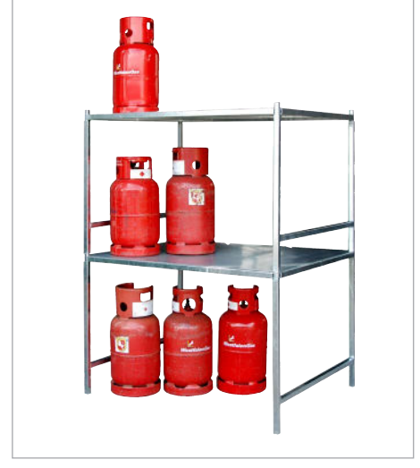
2x type GFG, stacked