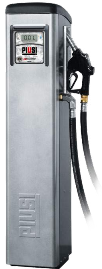
SELF SERVICE B.SMART