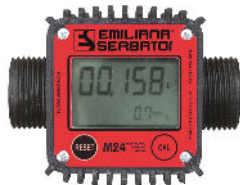
Digital fuel meter, mod. M24, for Diesel Fuel

For diesel and gasoline. Water absorption and impurity filtration. Filter capacity 10µm. Flow rate 70 l/min.