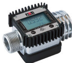
Digital flow meter for gasoline K24 ATEX