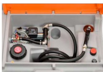
DT-Mobile Easy 980 Basic