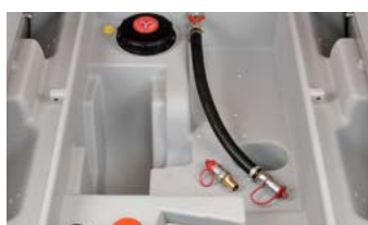
DT-Mobile Easy 980 without pump, with quick coupling