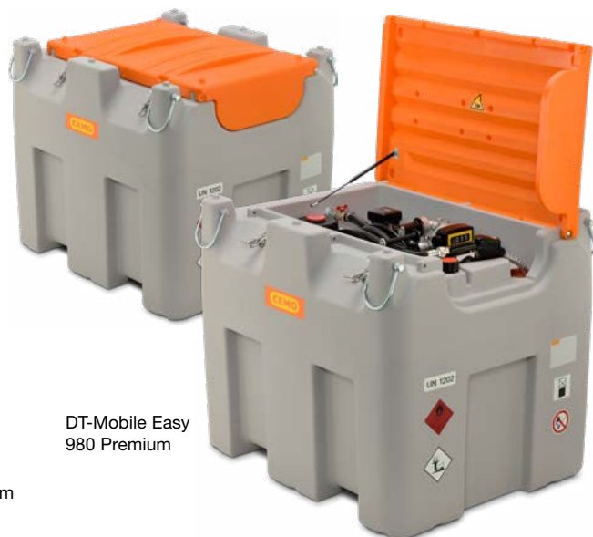
DT-Mobile Easy 980 Premium