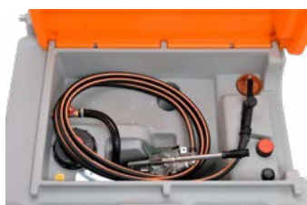
DT-Mobile Easy 980 with hand pump