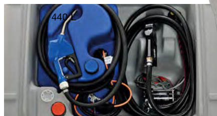
440/50 L COMBI with pump 12 V