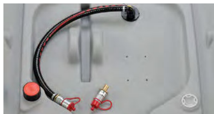
440 L with quick coupling