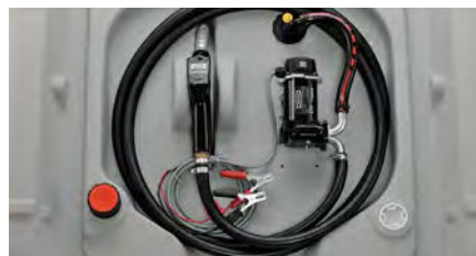
440 L with pump 12 V