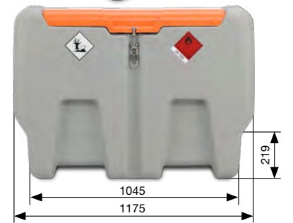
440 L and 440/50 L