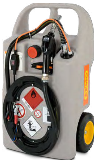
Diesel trolley 60 L with 12 V pump CENTRI SP30