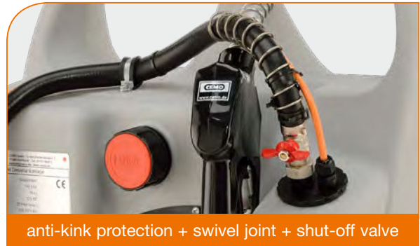
anti-kink protection + swivel joint + shut-off valve

The integrated vent system means that fuel can be taken out continuously without the trolley needing to be opened.