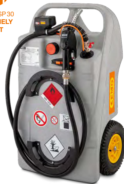
Diesel trolley 100 L with 18 V pump CENTRI SP30 and CAS battery

Accessory: digital flow meter K24 for assembly between dispensing hose and automatic nozzle for the version with electric pump, see page 121.