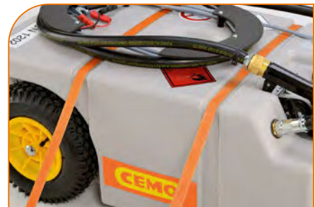
recesses for lashing straps

Integrated dispensing nozzle holder with lock.