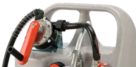
Diesel trolley 60 L with crank pump

Accessory: digital flow meter K24 for assembly between dispensing hose and automatic nozzle for the version with electric pump, see page 121.